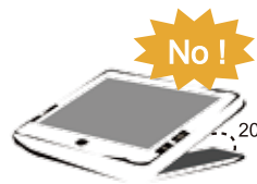
SNOW 7 HD